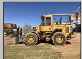
Volvo L90E Loader