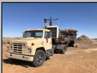
International Truck & Hay Grinder