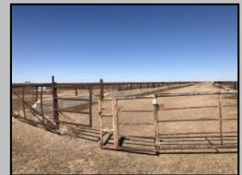
Feed Alley & Bunk