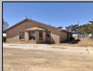
Office & 100,000 Lb. Truck Scales