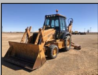
Case 580 Super L Backhoe