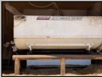
Roto-Mix 620-16 Stationary Mixer