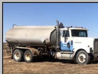
1990 International 9300 Water Truck w/4000 Gallon Tank