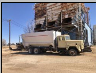
International Feed Truck w/Kuhn Knight 70110 ProFeed Mixer