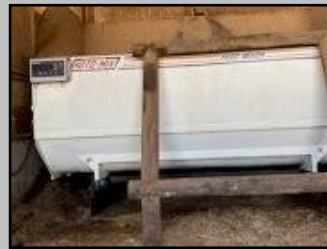
Roto-Mix 620-16 Stationary Mixer