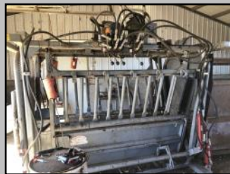
Bowman Chute in Processing Barn